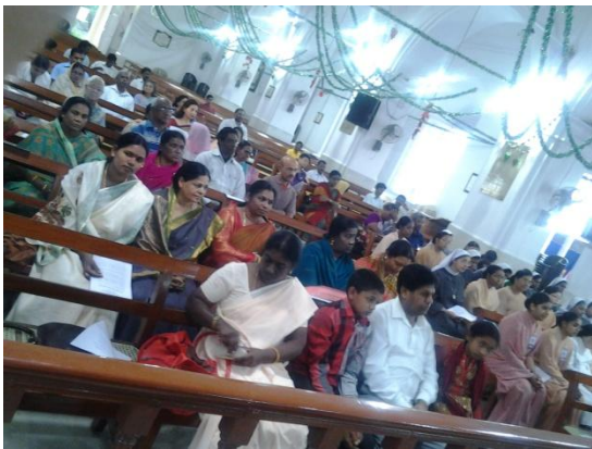
Photoes of UNITY OCTAVE FELLOWSHIP MEET 26.1.'13 @ TRINITY CHURCH